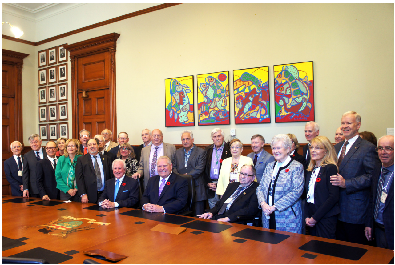
Two Premiers, Hon. Ernie Eves and Hon. Doug Ford, seated at the Cabinet Table