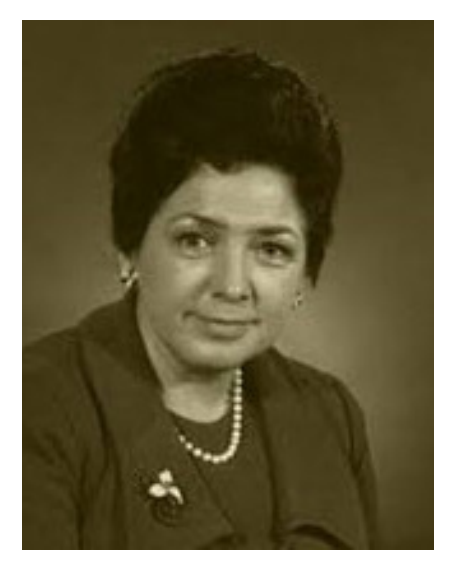
Bette Stephenson