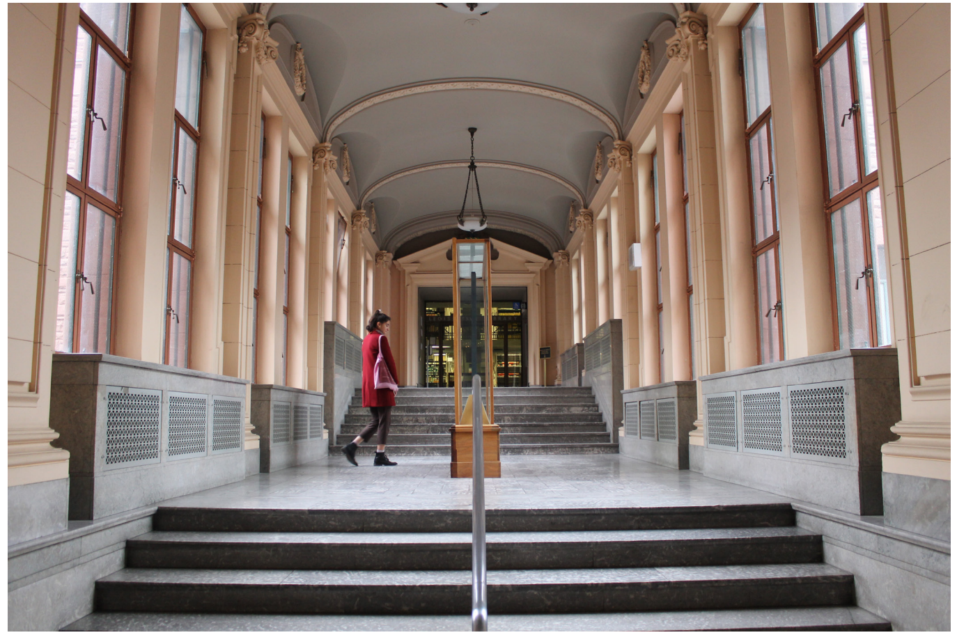
The hallway before the Library in the Legislative Building.

The Speaker has the power to decide whether, and which, amendments to bills or motions can be debated and voted on. This risks putting the Speaker in a highly political position, having to make a judgement on which amendments are worthy of debate. However, there are several principles that guide the Speakers' decisions and seek to ensure impartiality, the most important of which is the need to protect the rights of parliamentary minorities. The Speaker will usually allow amendments tabled by the Opposition frontbench as a point of principle. However, they may also select a key backbench amendment to provide an opportunity for parliamentary minorities to air their views.