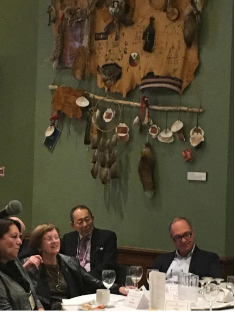
Guests sitting in front of art.