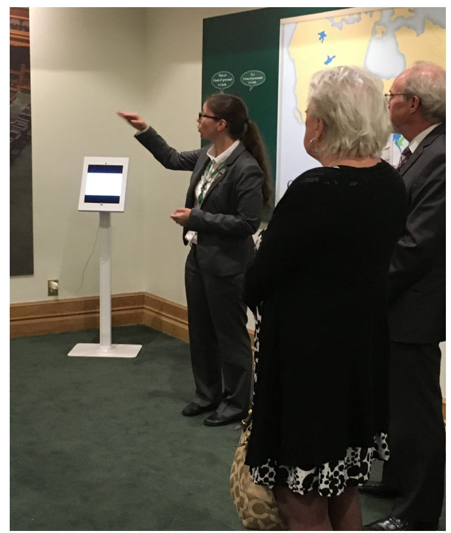
Guests from Manitoba and Quebec enjoy a tour of Queen's Park.